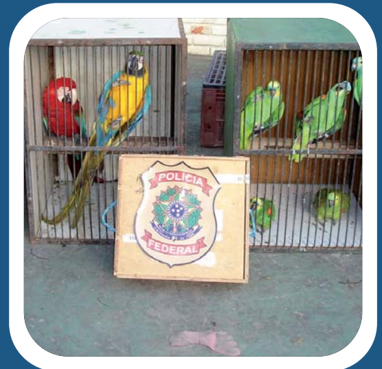
Wildlife seized as part of Operation Oxossi