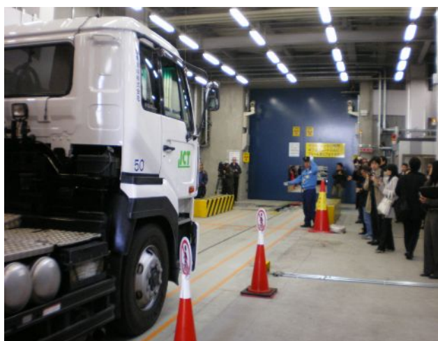
Picture: A cargo truck going through an x-ray inspection machine at the Yokohama Customs, Kanagawa, Japan.

The meeting was held in Yokohama, Japan from 27 th - 29 th January 2010. It was to learn the latest information on rules and regulations on hazardous wastes and second-hand electrical and electronic equipment (EEE), customs regulations and border control activities, difficulties and obstacles in frontline enforcement activities of the Basel Convention. It also discussed possible mitigation measures in cooperation with the competent authorities, and identified possible area of collaboration among national authorities, international organizations and the Asian Network.